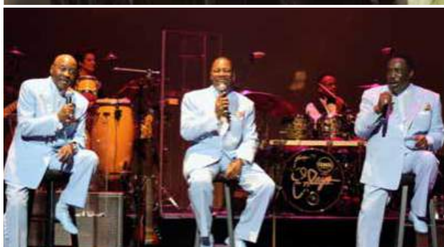
Rock and Roll Hall of Famers The O'Jays perform for the capacity crowd.