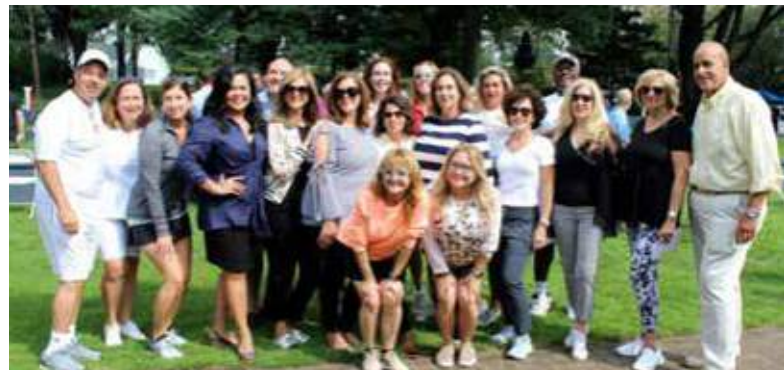
Several of the bocce players gather for a photo with WCBS 101.1 FM radio personality Joe Causi (right).