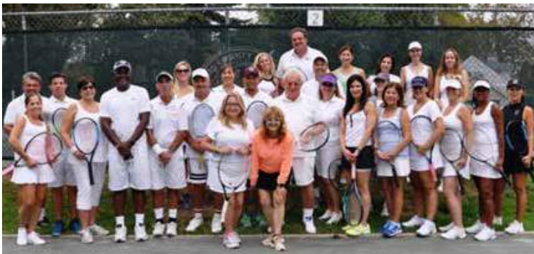
A group photo of all the tennis players.